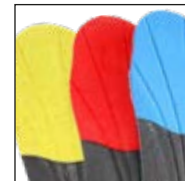
HAIX® Vario Wide Fit System