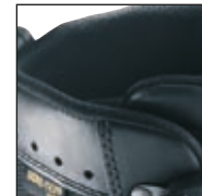
Soft upper shaft edge trim